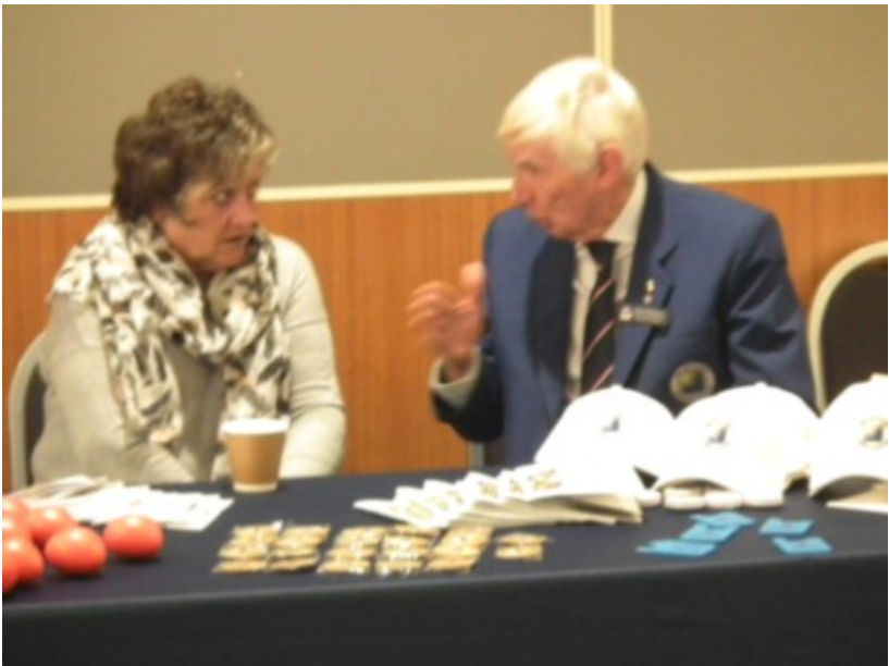
Spotted at last months RSL NSW State Congress.