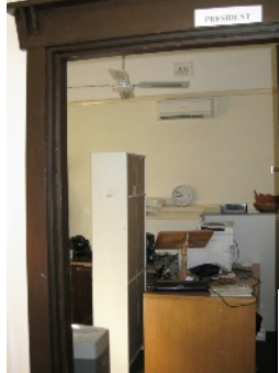
Presidents office and desk during the renovations