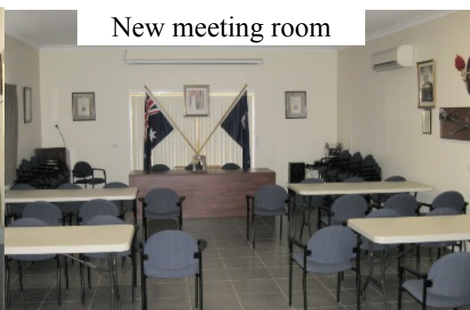
New meeting room