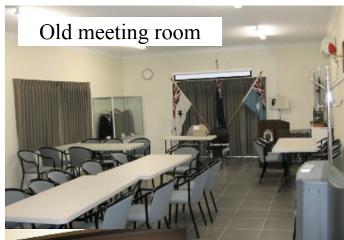
Old meeting room