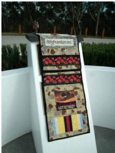
The unveiling of the Afghanistan plaque at the Albury War Memorial.