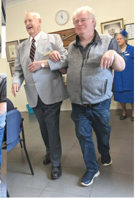
Melbourne Cup Fashions off the Field