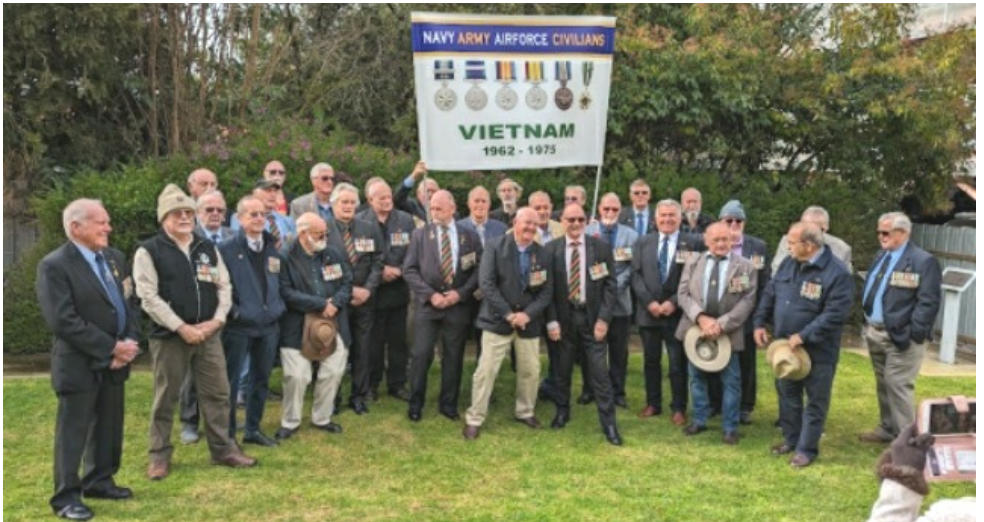
2 RAR reunion was held in Albury which gave its members the chance to commemorate along with the members of our sub branch.