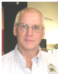
Vice President & Welfare