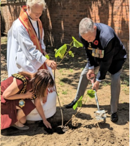
Story of the Fig Tree on next page.